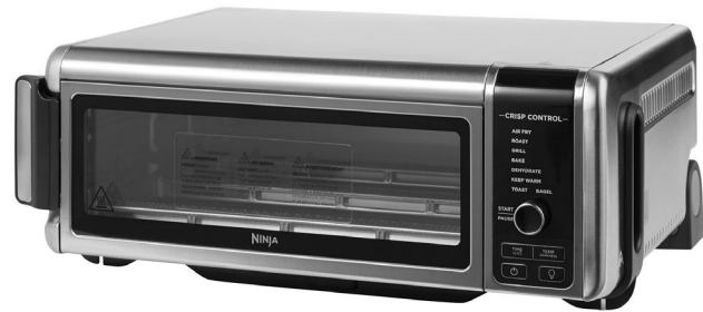
Ninja® Foodi® 8-in-1 Multifunction Oven SP101EU