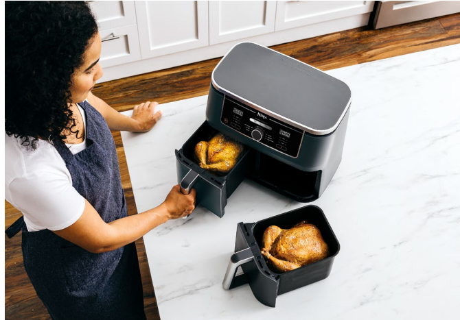
Easily fit a 2kg chicken in each drawer