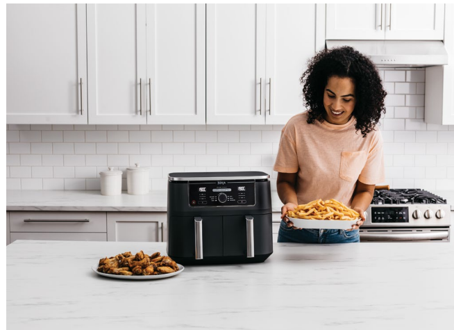
Large capacity for 8+ people