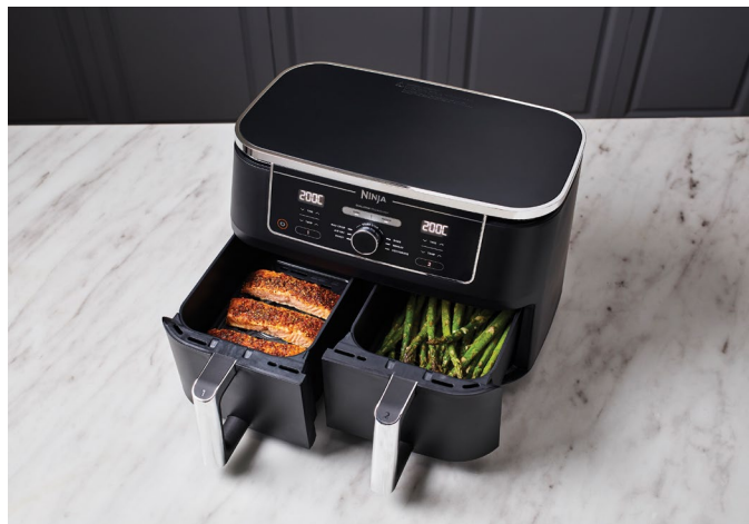
Different foods, times and programs – ready at the same time