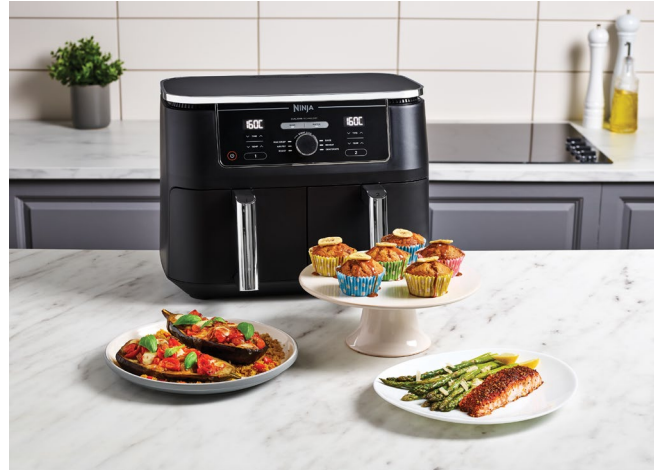
More than an Air fryer, with 6 different functions.